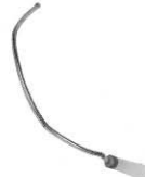
Magnetic Retrifer (Pick Up Tool)