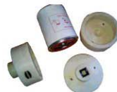
Oil Filter Socket Available in 3/8" and 1/2" Drive (Nylon Material)