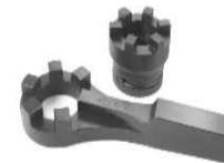
Castellated 6 Pronged Socket & Castellated 6 Pronged Slugging Wrenches (GE Design)