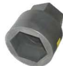
Stack / Insert Socket for Slugging Wrench