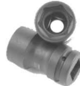
Combination Budd Wheel Socket (Special)