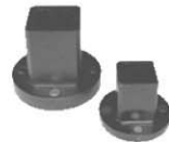
Top Hat Adaptor (Magnetic) (Special)