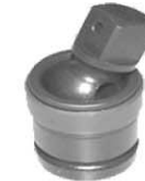
Impact Swivel Joint (Ball Type) (We also Manufacturer Swivel Handle)