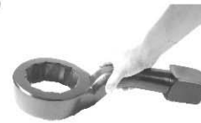
Offset Slugging Wrench