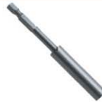
Slotted Power Bit (Minus Bit) with Bit Finder