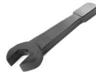
Open Jaw Slugging Wrench